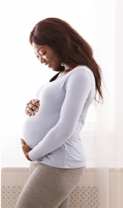
Vermont Department of Health

Purpose: To reduce maternal mortality and severe maternal morbidity (SMM) in Vermont and advance sustainable improvements in maternal health service delivery, data collection and policy development.